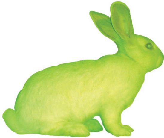
Figure 2. Kac created a genetically modified rabbit, Alba, who glows when exposed to blue light at 488 nm wavelength.

ing in the form we inherited it, and that new meanings emerge as we seek to change it." Genesis proclaimed that humans have dominion, but the writer of that book could never imagine the power that we've attained.