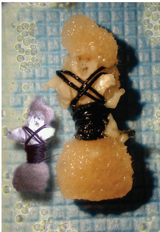
Figure 4. Semiliving worry doll H symbolizes our fear of Hope. This is a digital image of a handcrafted worry doll made out of degradable polymers and surgical sutures. The image is of the doll before it was seeded with McCoy cells (small doll), and after the tissue was grown and the polymer degraded inside the bioreactor (big doll).

Courtesy of Oron Catz, Ionat Zurr, and Guy Ben-Ary